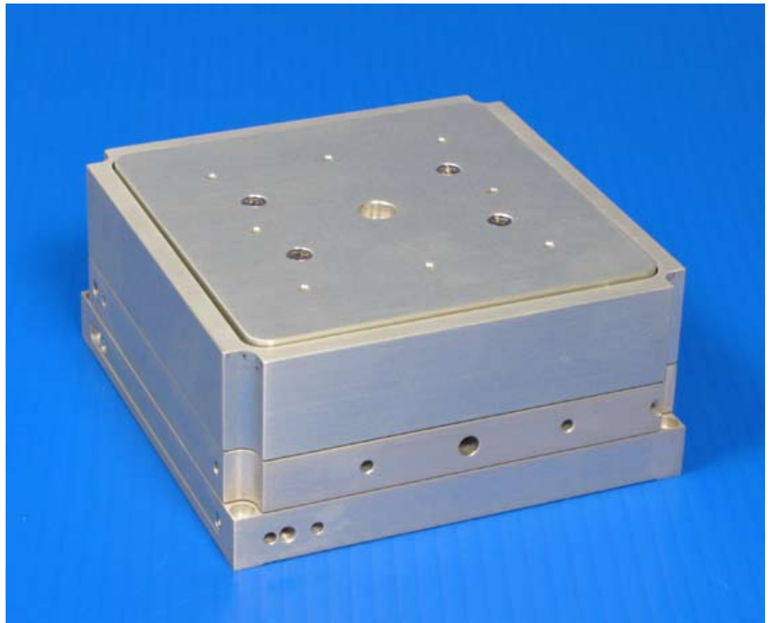
Nano-3D500 constructed from aluminum.

Examples, tutorial, and Nano-Route ® 3D supplied with Nano-Drive ® USB interfaces.