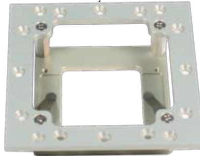
Re-entrant 2 inch slide or coverslip holder