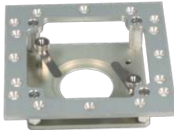
Re-entrant petri dish holder

Compatible with 2.6" x 2.6" aperture stages