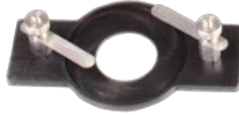
35mm petri dish adapter