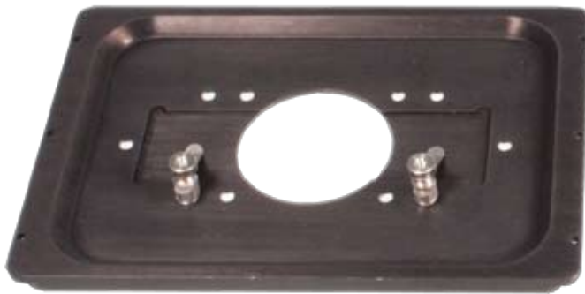
3 inch slide holder

Note: These designs can be modified to fit other stages