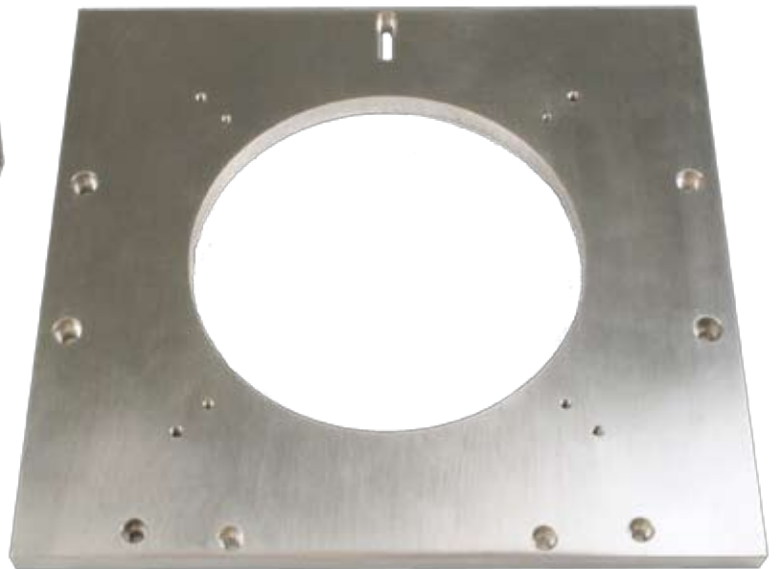
Olympus IX series, Zeiss Axiovert, and Leica DMI inverted microscope mount for the Nano-LP Series, Nano-Bio Series, and 2-axis Nano-T Series.