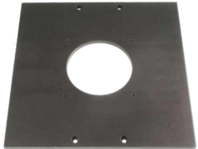
Olympus IX inverted microscope series mount for the Nano-H Series