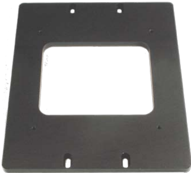
Olympus IX inverted microscope series mount for the Nano-LP Series and Nano-Bio Series

Mount nanopositioners directly onto microscopes without a coarse positioning stage