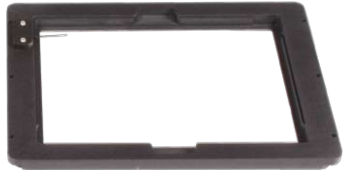
Multimell plate holder