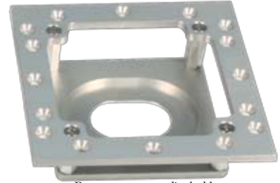
Re-entrant coverslip holder